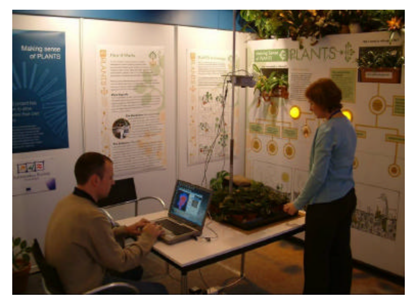
Fig 3. PLANTS Demo in operation