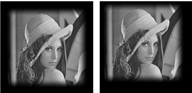
Figure 2: Unregistered images generated as in [10].

different translations in our experiments, produced by a generator of normally distributed random numbers with standard deviation equal to 10. The resulting numbers were rounded towards the nearest integers. The proposed iterative algorithm converged in all cases, but some re-initializations were needed. Note, in Fig. 1, where a correlation coefficient function along with its contour plot are shown for the case of window size 64 \times 64 , that the position of the first estimate lies in the main lobe.