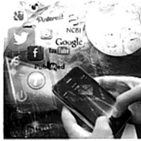
Present Time Dimension

Retrieving the Past: Historians and Their Sources