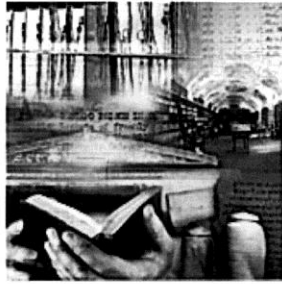
Past Time Dimension

Retrieving the Past: Historians and Their Sources